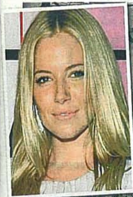
Sienna loves to put her feet up by the Italian coast

Getting there: British Airways ( www.ba.com ) offers return flights from Gatwick to Naples from £106. It takes approximately 45 minutes by car to Positano.